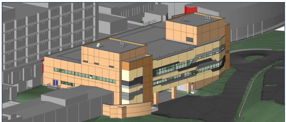
Artist Rendering of the Grossmont Hospital Diagnostic and Treatment Building