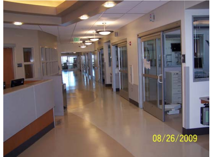
The above pictures are of the 2 nd floor prior to staging the rooms with furniture. The top two pictures are standard patient rooms and the bottom two pictures are of the corridor and nurse stations.